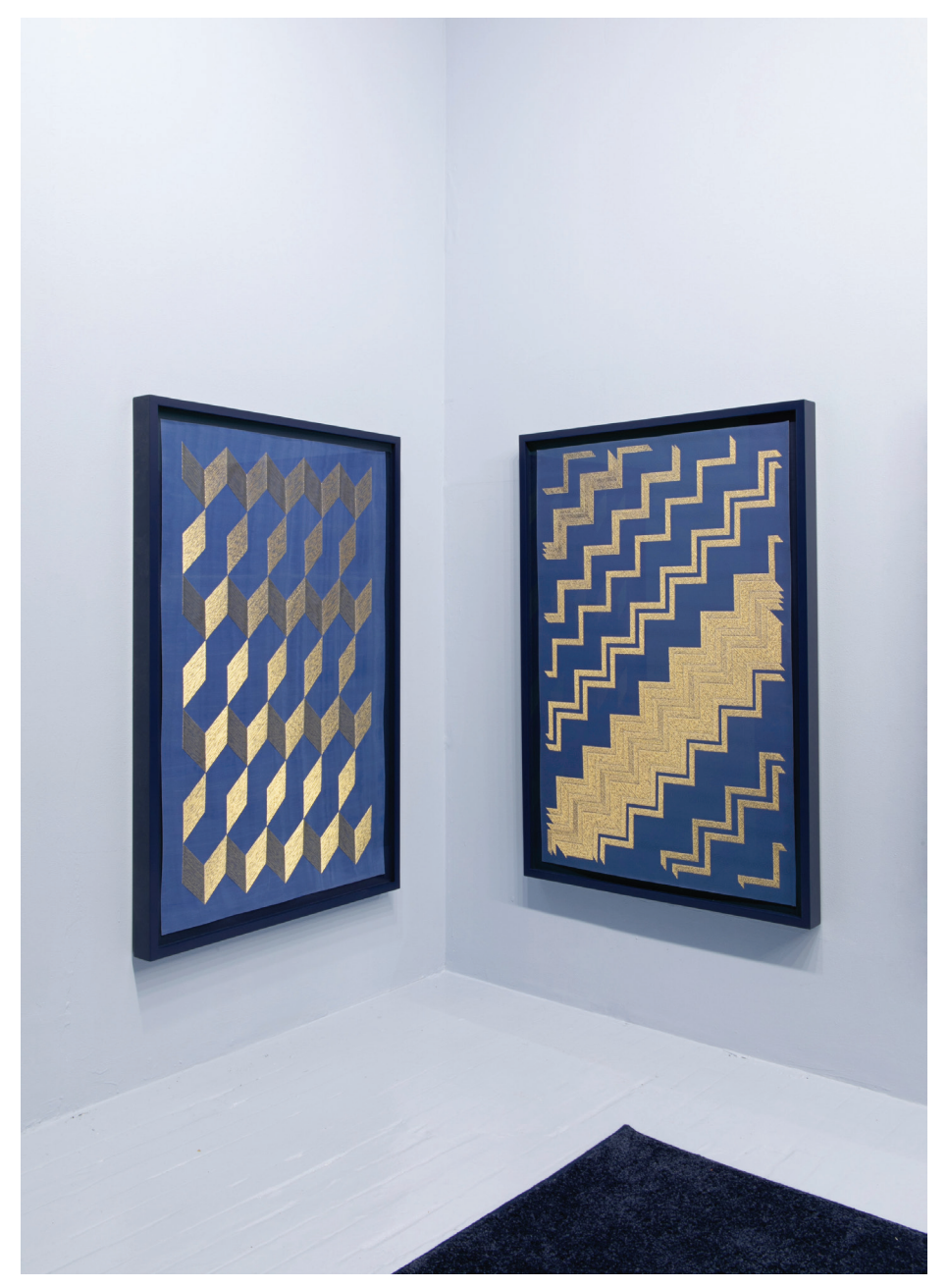
Installation view of "Abdolreza Aminlari: For a Different Future" at Situations in New York.

"Abdolreza Aminlari: For a Different Future," at Situations (through February 24): Paint, paper, and thread all come together in the intricate and intimate work of Abdolreza Aminlari, a Brooklyn-based, Iranian-born artist, now on view at Situations gallery on the Lower East Side. With works on paper made of blue gouache and gilded thread, Aminlari alights on the culture of Persian textile by way of the Azulejo tiles of Porto, Portugal. More than some magic carpet ride, these smart geometric abstractions are transporting and rooted in equal measure.— JP